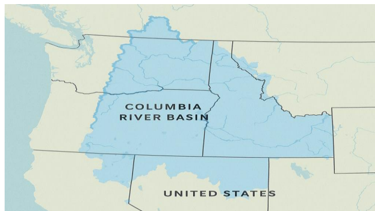
Figure 1: Geographical Extent of the Columbia River Basin

Figure 1 shows the Basin of the Columbia River Basin, one of the largest watershed systems in North America, spreading to seven American states and parts of British Columbia, Canada. The basin includes the main Columbia River and a broad network of tributaries, which are important to support fish houses, especially migratory species such as Chinook salmon and steelhead trout. Visual delimitation of habitat helps to identify the relevant areas for modelling and conservation schemes.